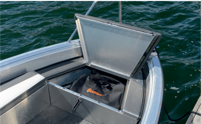
A large storage space in bow