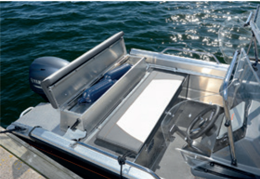
A practical storage space for e.g. fenders inside the back rest