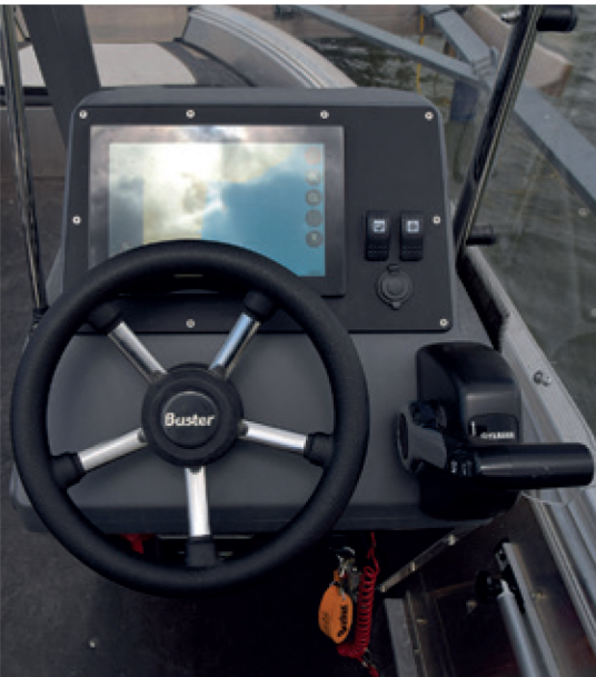
Buster Q 10" as standard