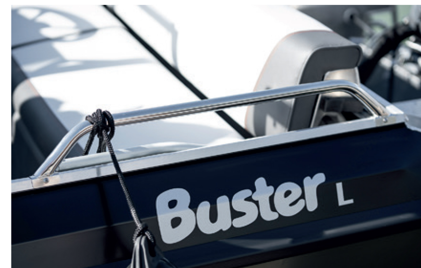
Functional railings and a dark color panel are standard equipment.