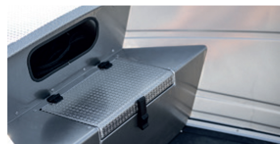
Bow with instep and lockable stowage