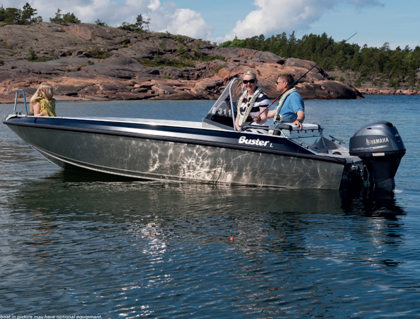
The boat in picture may have optional equipment.