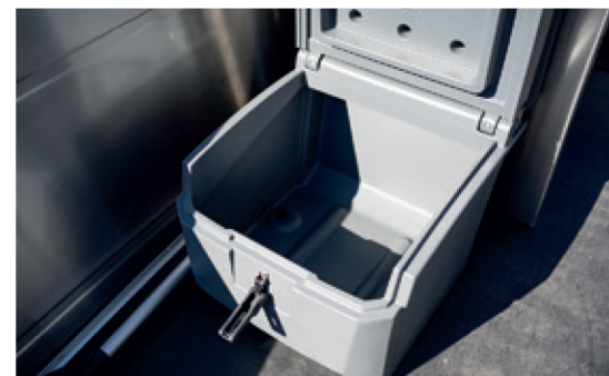
Stowage box in front of the console is a standard equipment. Cushion as an accessory.