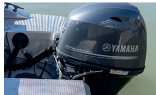
Sizeable bathing platforms