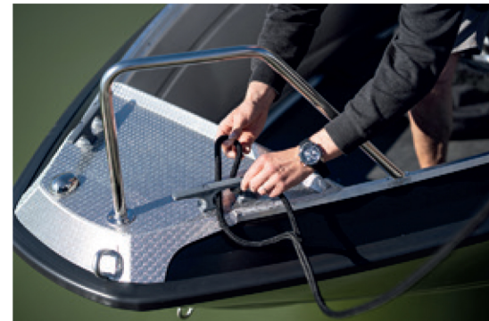
A functional, sturdy railing on the bow