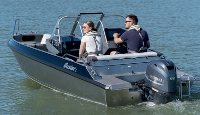
Sizeable bathing platforms provide easy access.