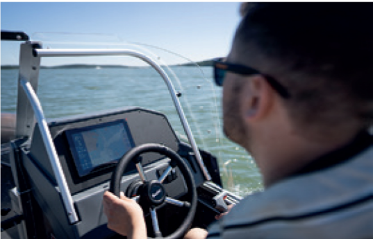
Buster Q 10" as standard