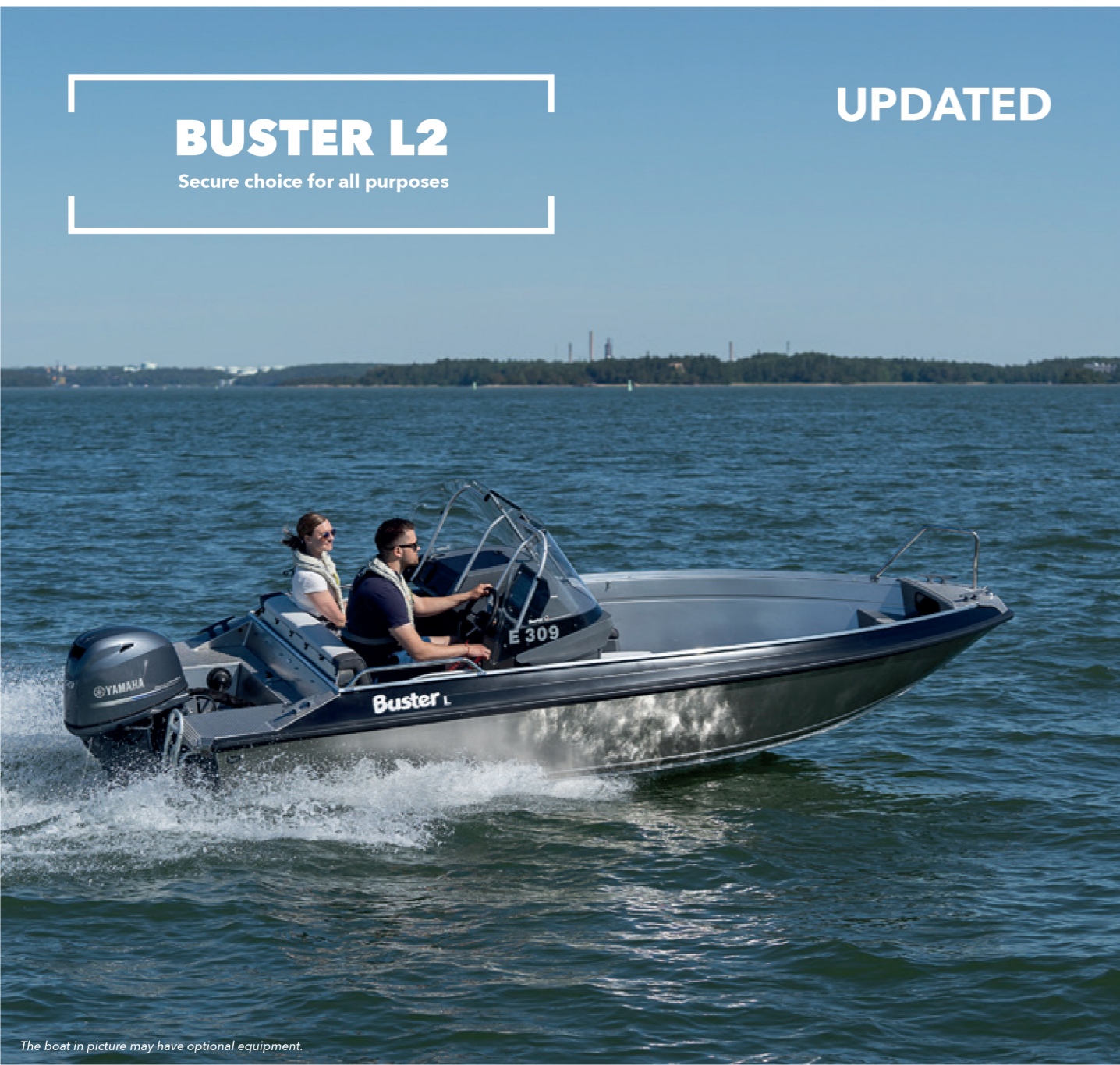
The boat in picture may have optional equipment.