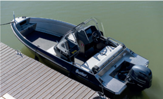
Composite deck as standard