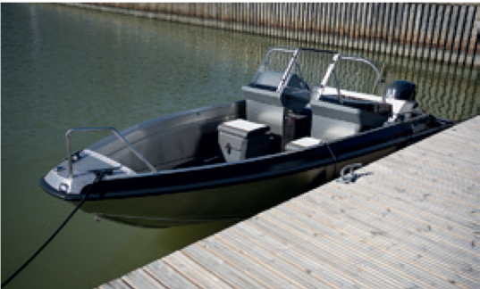
Flexible general arrangement due to the removable seat/stowage boxes