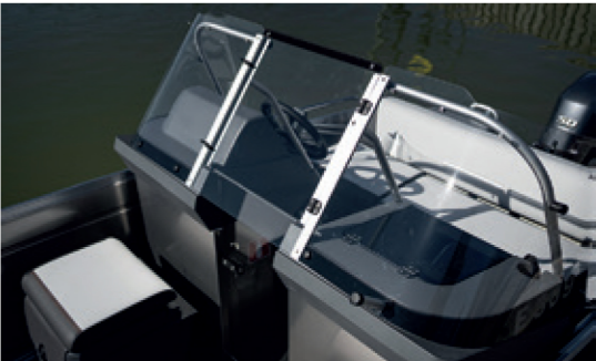
The fixed door between the consoles protects from wind and spray.